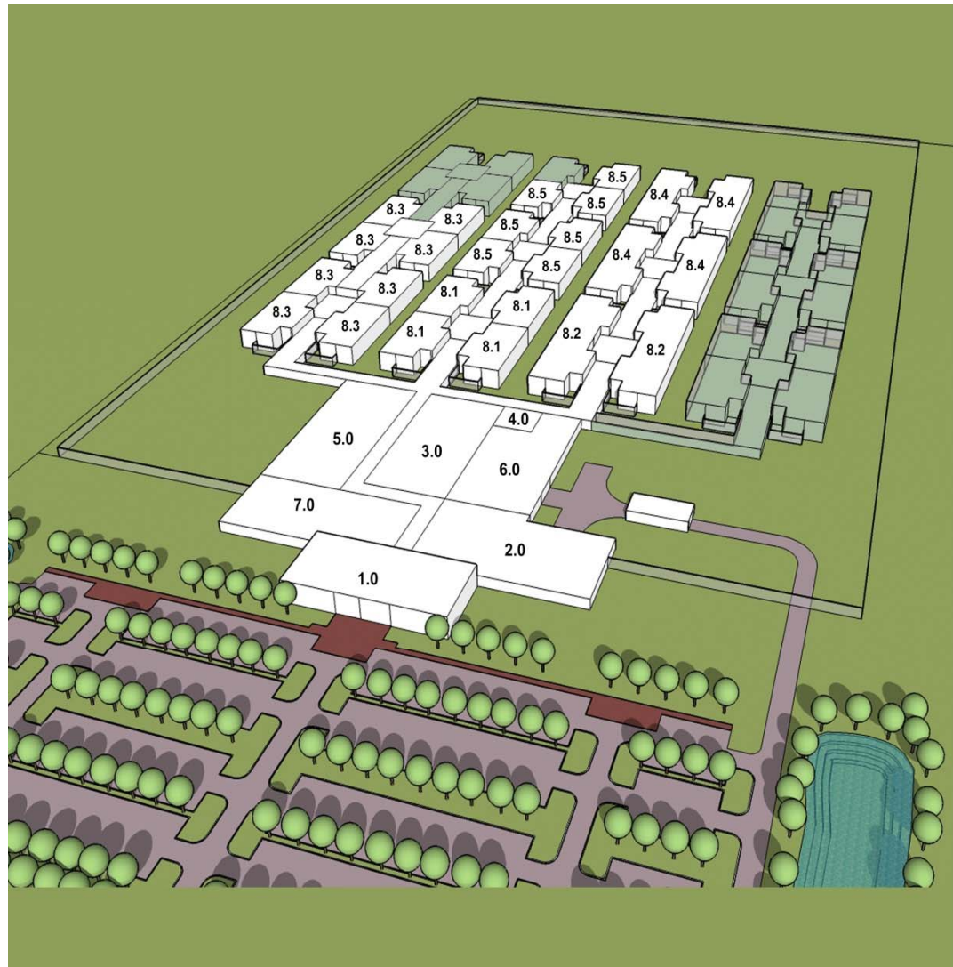
Escambia County Site Plan